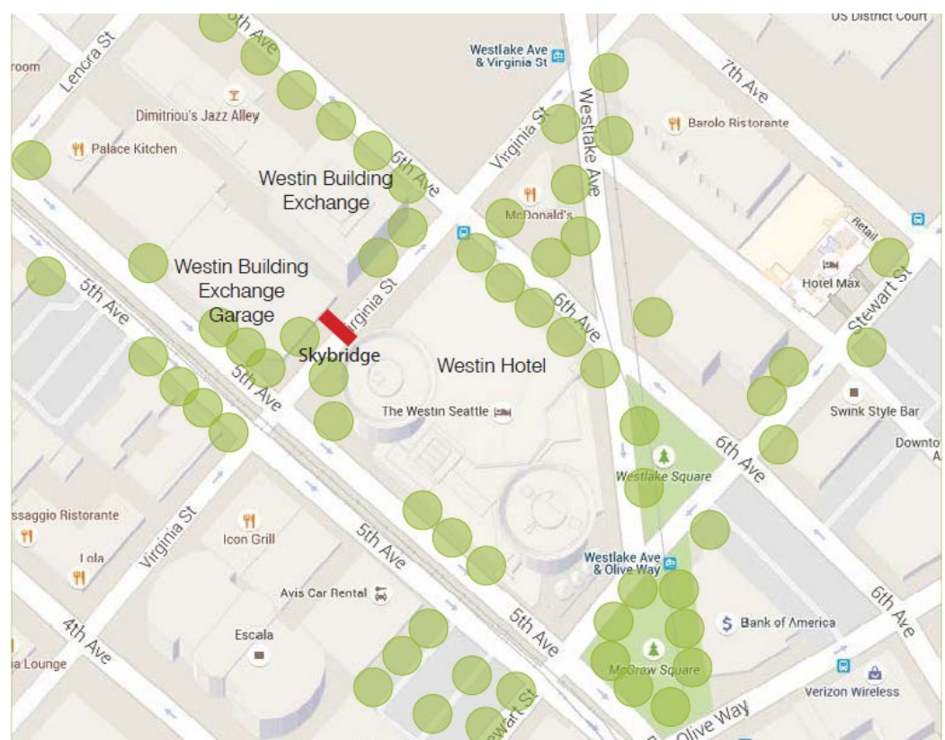
Figure 1: Site context map